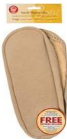
Suede Slippers in many sizes