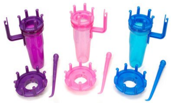
Easy Knitting Mini Knitter with 2 loom sizes! Item # 21-1171-61 Asst. colours.