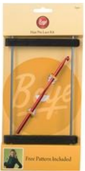
Hairpin Lace Tool 85-3707405