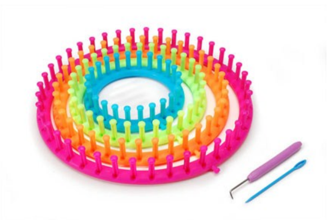
4 pc. Round Easy Knitting Looms Item 21-1171-58 Includes a yarn needle and a loom pick